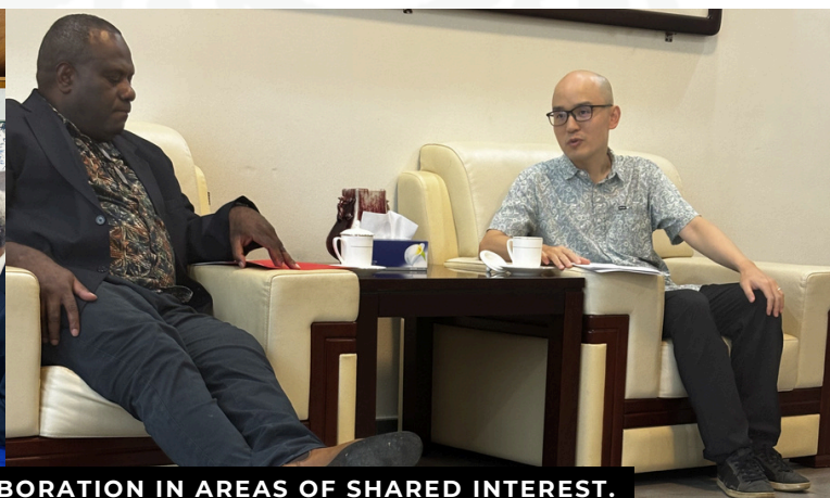
EXPLORING OPPORTUNITIES FOR COLLABORATION IN AREAS OF SHARED INTEREST.